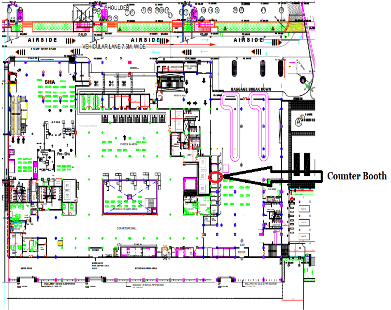
GF LOCATION PLAN AT JAMMU AIRPORT