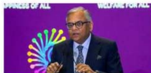
Tata Group Chairman N Chandrasekaran

that employees have shown "great tenacity" in dealing with a "perfect storm", urging them to maintain the same approach going forward.