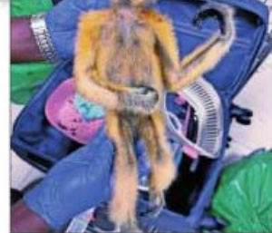
AGONISED LIVES: Indian palm squirrels, silver gibbon, yellow-cheeked gibbon (clockwise from top left) and wolf spider (centre) seized from flyers at Chennai airport

During inquiries, the passenger, an Indian national working in Malaysia and returning to Chennai after three years, claimed he was handed over the luggage by another person at the airport and promised monetary gains upon delivering the consignment. He was arrested under the Wildlife Act and remanded in judicial custody. The species were repatriated to Malaysia through the same airline. Customs officials said they have come