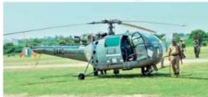
Indian Air Force helicopters seen landing at the existing aerodrome in Adilabad (file photo).

Speaking to Deccan Chronicle, Adilabad MLA Payal Shankar said the runway will be 2.5 km long as the total length of