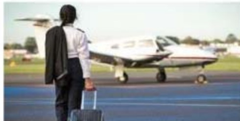
CRISIS SUPPORT. The Centre has supported scheduled service providers from the impact of crude oil price volatility

Notably, the Centre has supported scheduled service