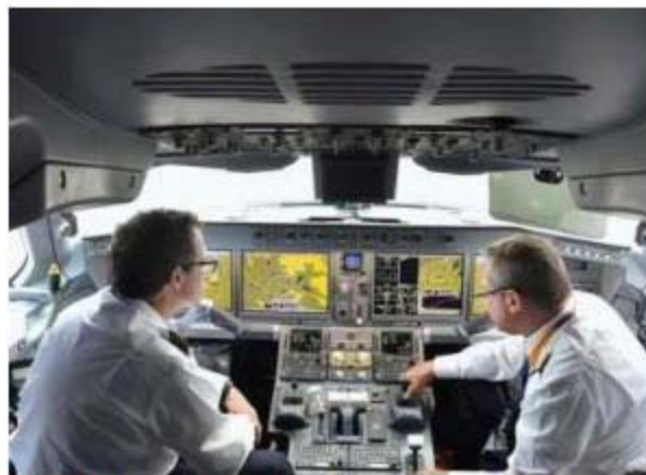
THE TALLY. India has 10,261 airline transport pilot licence holders; 12,480 hold commercial pilot licences for aeroplanes and 777 have commercial licences for helicopters

Further, sources said Air India's training ecosystem is being developed across multiple locations.