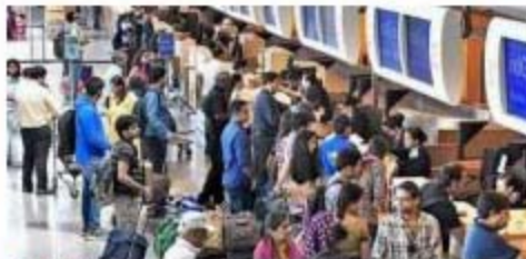
SKY HIGH. International airfares have risen about 43%, with average ticket prices climbing from ₹52,000 in April 2025 to ₹74,500

The fare increases come even as the Ministry of Civil Aviation implemented multiple measures to ease the cost pressure on airlines, including removing fare caps and keeping the 60 per cent free seat allocation rule in