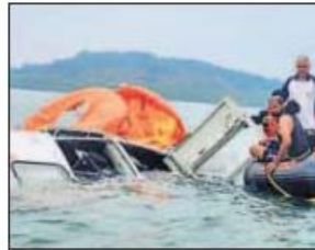
The helicopter crash landed on February 24, killing one.

“The floats were not armed in the cockpit during the approach although the same is required by the Standard Operating Procedure for operations at Port Blair as approved by DGCA in the company operations manual,” the report stated. The floats failed to deploy on water impact. The aircraft toppled onto its starboard side, coming