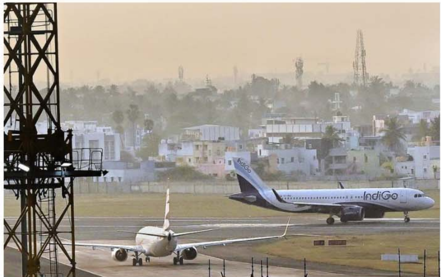
Soaring cost: Travel agents say they are keeping a close watch on the airfares as the holiday season is approaching. B. VELANKANNI RAJ

While the cost of a one-way flight from Chennai to Madurai ranges between ₹7,200 to ₹8,200, the fares for Thoothukudi ranges between ₹7,000 and