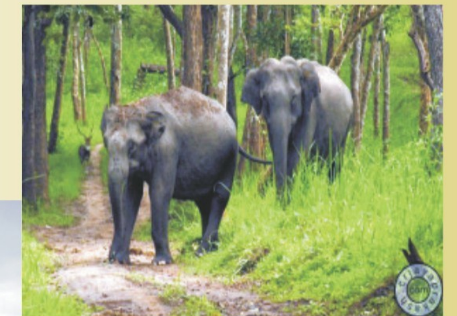
Wynadu 85 KM By Road

The Place where Portugese Navigator Vas Co Da Gama Landed In 1498