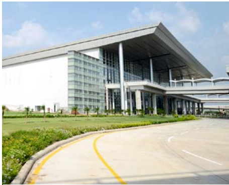
New Civil Air Terminal Chandigarh

Constructing such a magnificent Terminal Building at a cost of Rs.65,000/-per sq.mt. is a milestone in itself which will pave a new way in the country so far as the development of airport infrastructure is concerned and it will surely boost the overall connectivity for Tourism and Trade in the Country.