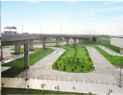
Landscape at New Civil Air Terminal Chandigarh

Issued by Public Relations Department For details please contact : GM(PR), AAI – 011-24622787, 9810025069 No. 39/2014-15