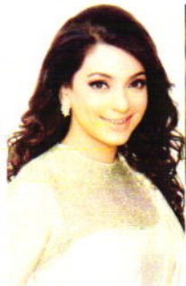
Juhi Chawla, Nawazuddin Siddiqui

India joins in as world readies for climate change